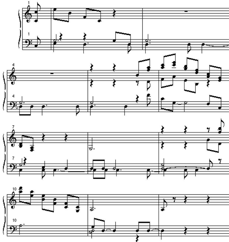
Figure 3. GPmuse result.

The discussed result (Figure 3) was generated by the reranked best individuals in the 40th generation of a run of 50 generations of 500 individuals per subpopulation. The piece's adjusted fitness was a perfect 1.0.