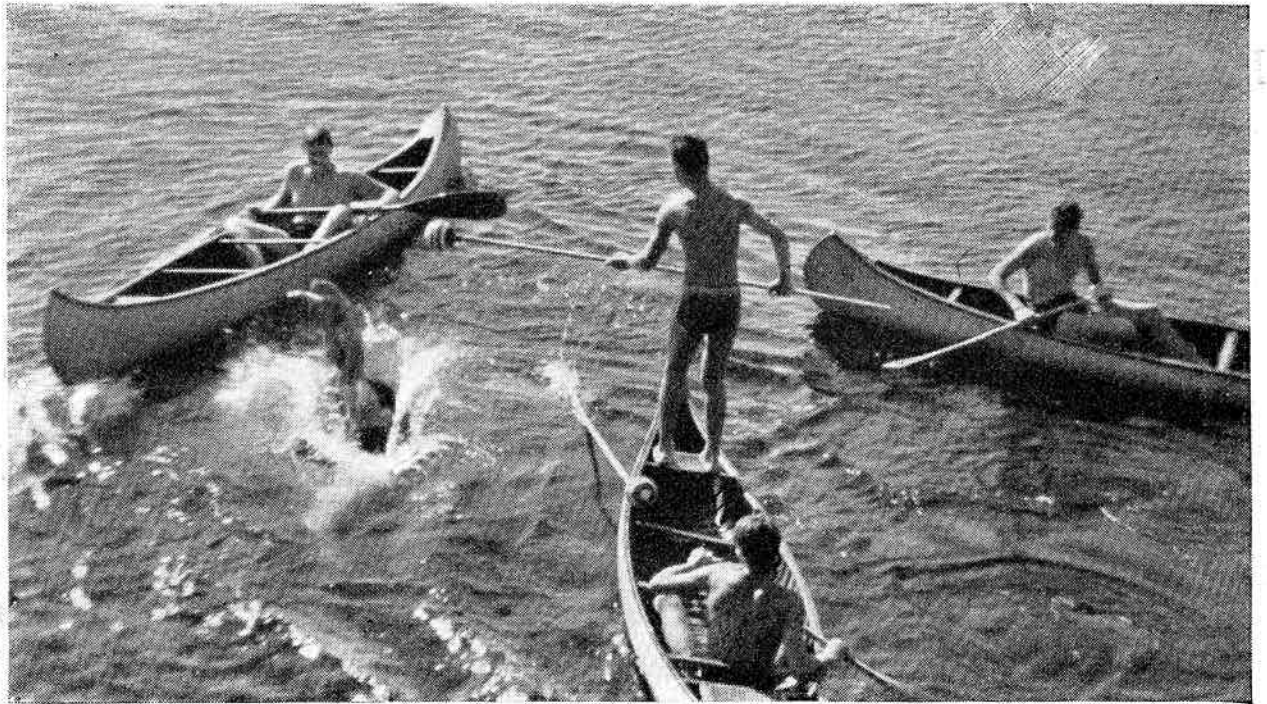
FUN FOR EXPERTS!—who have passed their swimming and canoeing tests.