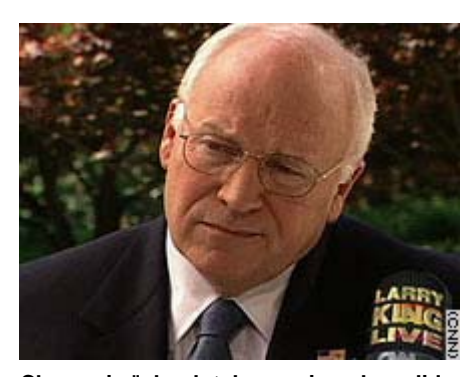
Cheney is "absolutely convinced we did the right thing in Iraq.'