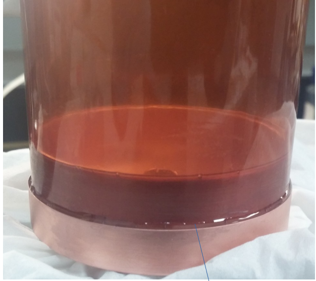
Ring of glue