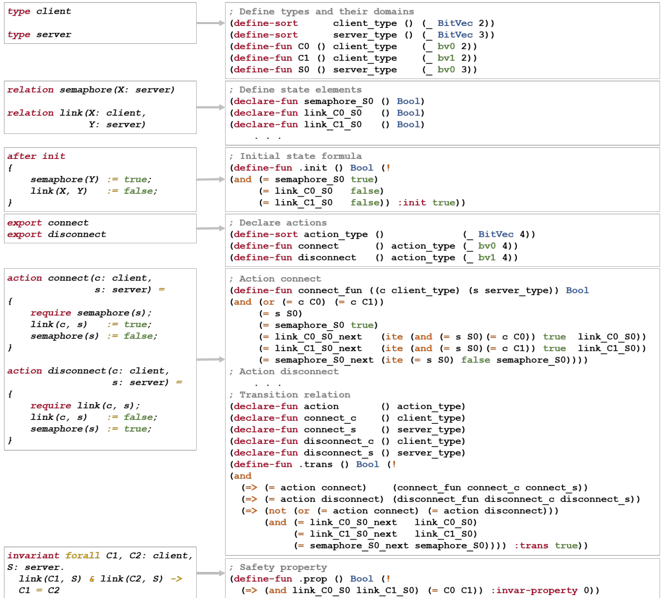
Figure 2. Translation of lock server in Ivy to a finite instance (1 server / 2 clients) in VMT. Note that our VMT representation uses different vector sizes (1 for boolean, 2 for clients, 3 for servers) as an easy way to ensure that the model-checker does not try to compare values of different types.

the unbounded case. We call such clauses instance-specific clauses. Section 5 discusses how these are pruned during invariant generalization. Note, finally, that concretization is not a panacea. It is a manual and error-prone process and should therefore be used only when necessary to overcome the limitations of model-checking.