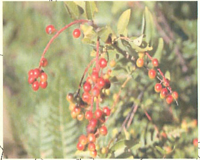
North Point Park