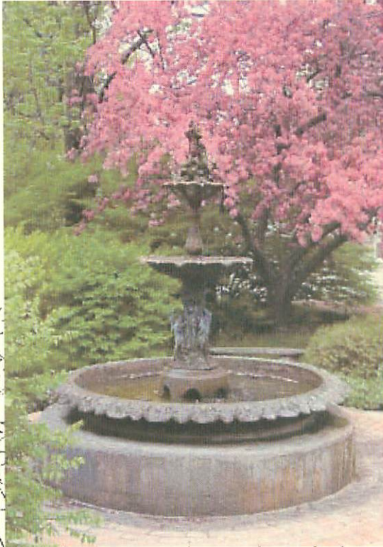
Memorial Fountain, Onekama Village Park