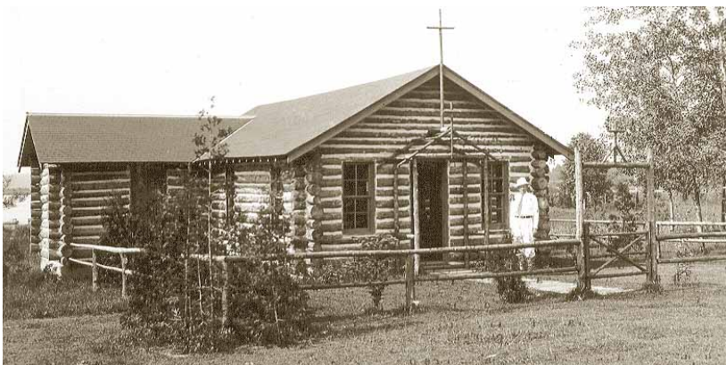
St. Mary's Chapel