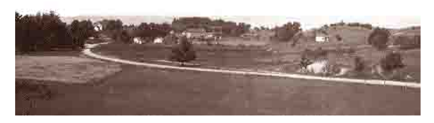
View Looking Southwest from Farmland Northeast of Pierport

Early View from East Showing What Is Now Thirteen Mile Road as It Curved into Pierport. The George Schafer Farm Was Located North of This Road