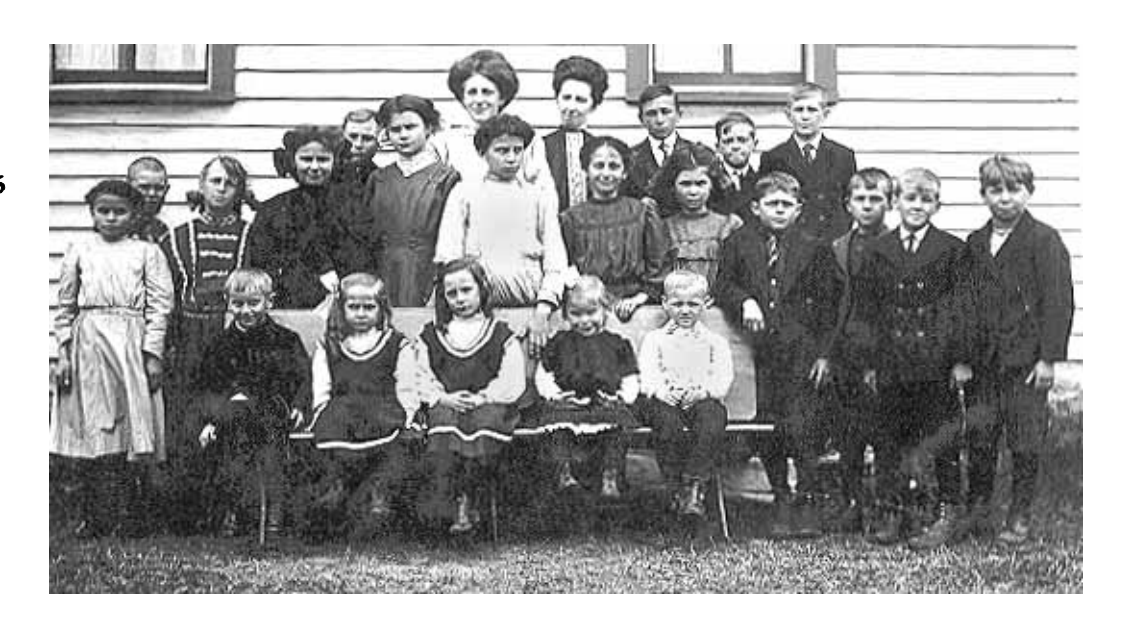
Students of 1909-

has been converted into a residence. Many of the buildings of Pierport disappeared as the village declined rapidly starting in the 1890's and particularly after the demise of the Railroad (the rails were removed in 1902).