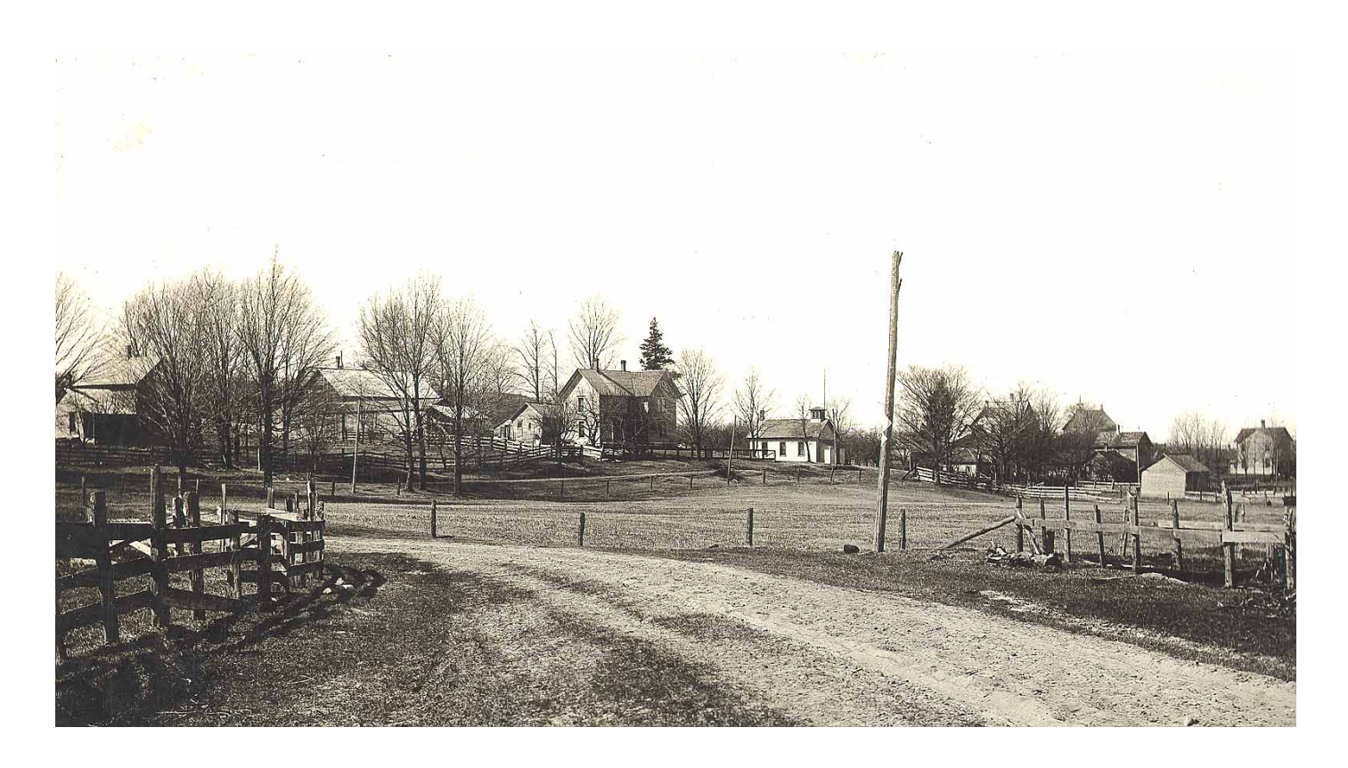
The Pierport School Is Shown Just Right of Center in This Early View of Pierport Looking Southwest