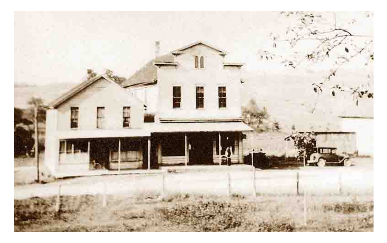
Perry's 1883 Store Eventually Was Moved across Thirteen Mile Road and an Addition Was Erected; Both Buildings Have Been Removed