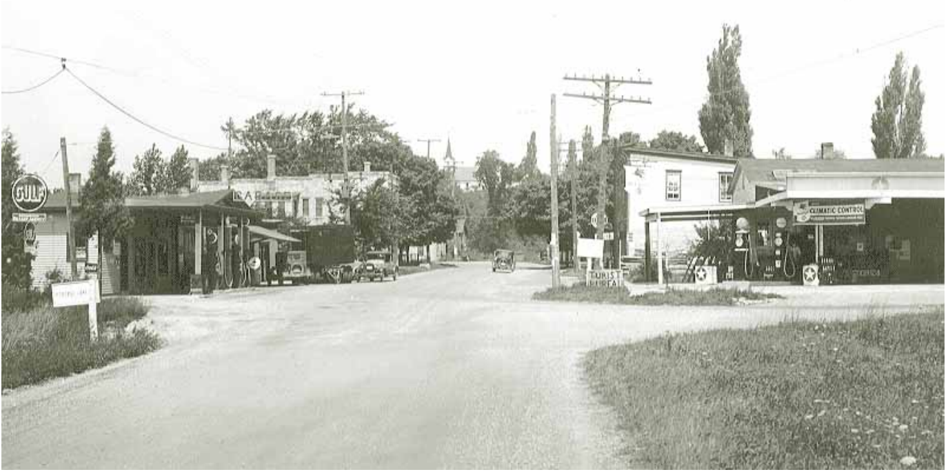
At Right Edge Is Brown Lumber Company; Blue Slipper Is on Left in Background