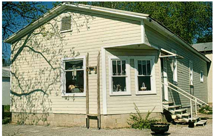
The Old Farm Store