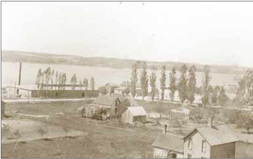
Onekama Canning Company-Onekama Packing Company, Site Southeast of Main and Third Streets. Building Completed in 1920