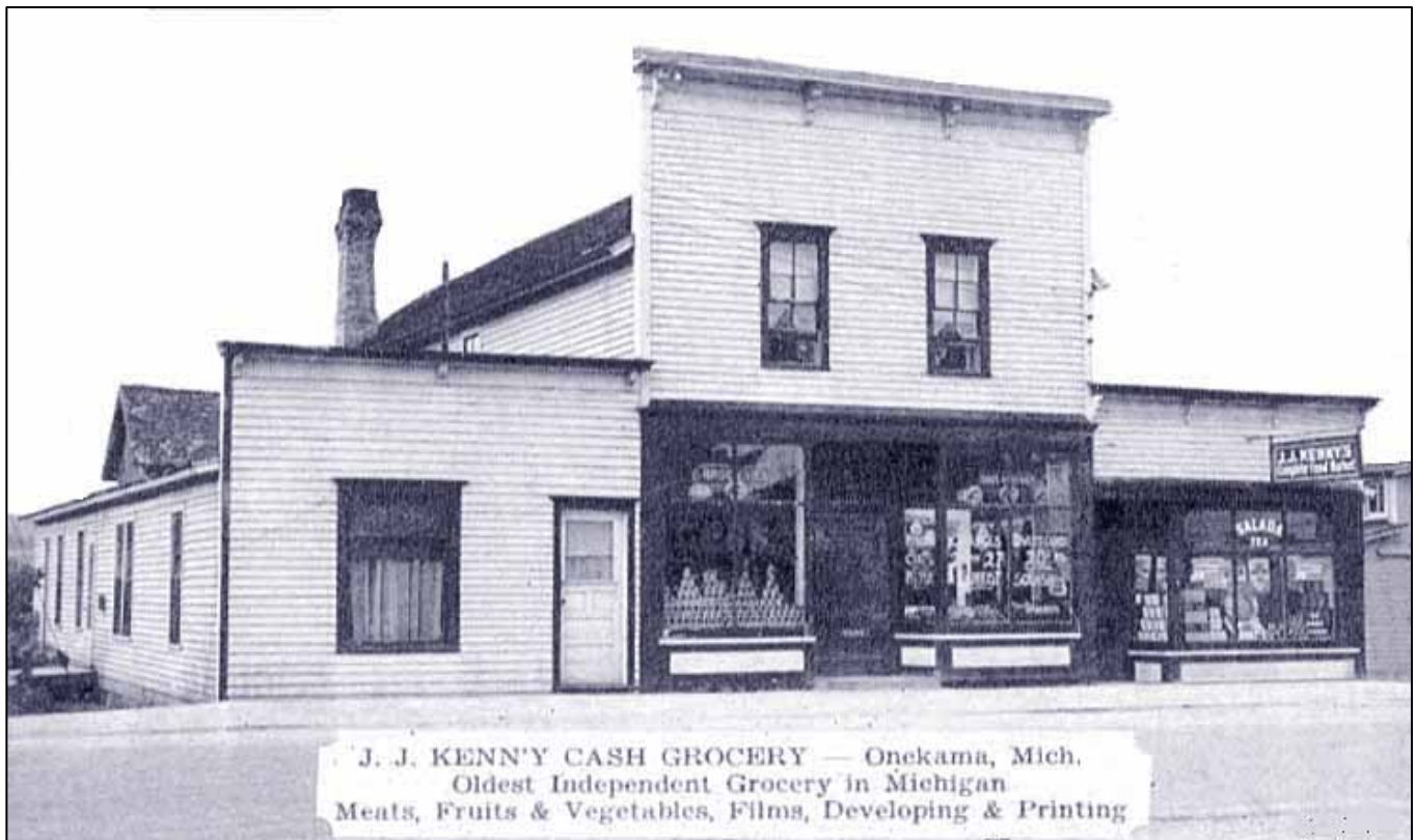
Site Southwest of Main and Third Streets