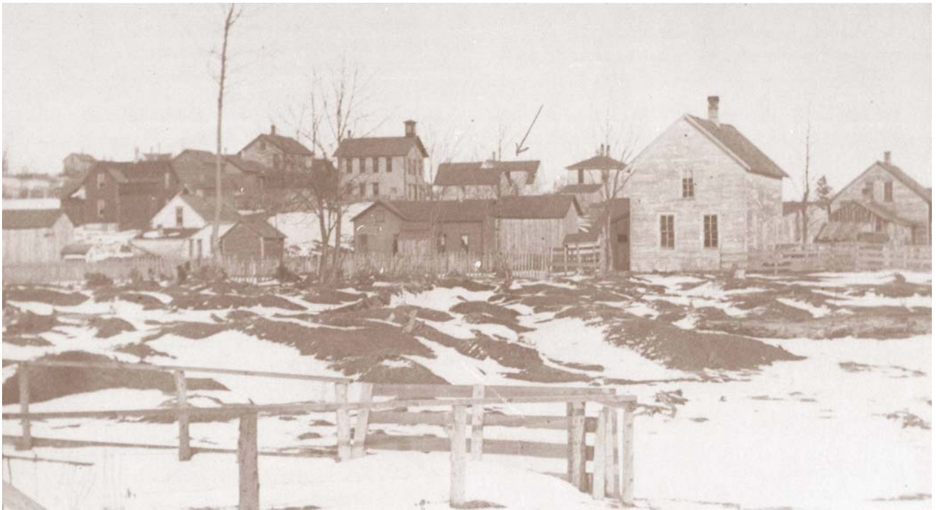
Early View of Intersection of Mill and Spring Streets with Arrow Pointing to Congregational Church Building Without Steeple; 1882 School Is to Left of Church Building

gathered with others for readings and prayer. In 1880, August Zosel platted from his farmland the west end of the Village and later offered to give a group established in 1882 and headed by Telford one of two lots on which the Church now stands. In 1887, A. W. Farr read a statement of expenses for the Church building, which cost $1,600 and was dedicated in that year.