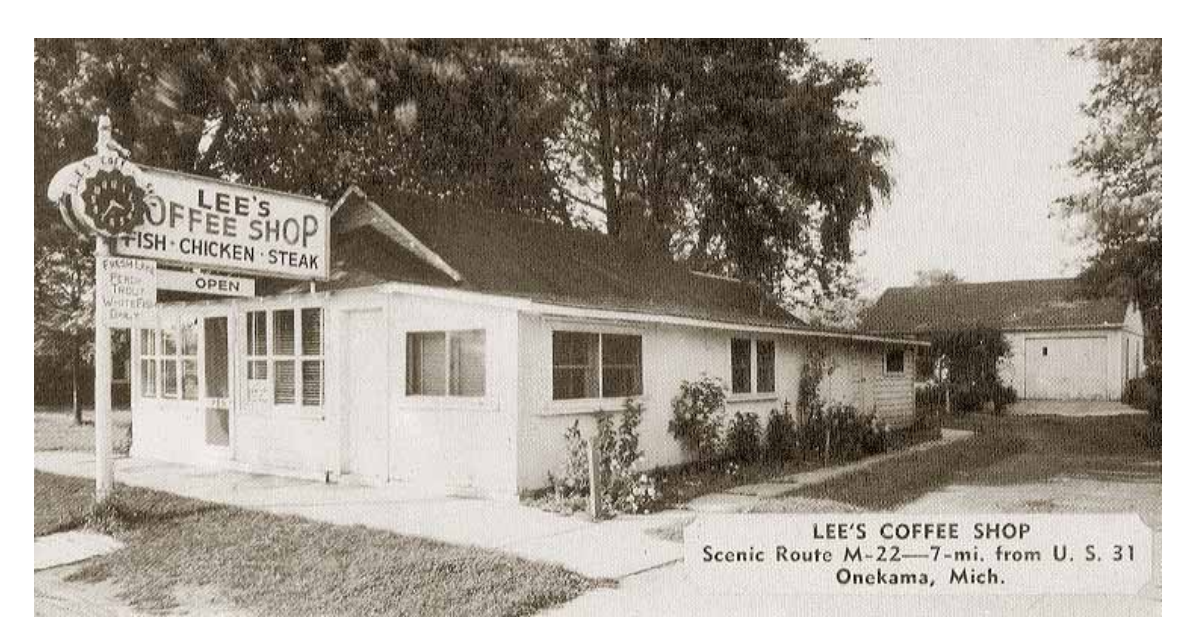
4774 Main Street