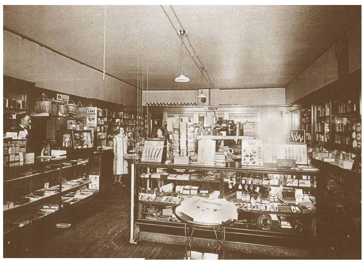
Knuth Drug Store

Main Street Looking West—Large Structure in Center of View Is Knuth Drug Store Building after West Storefront Was Added; Two Doors to Left Is School-Commercial Building