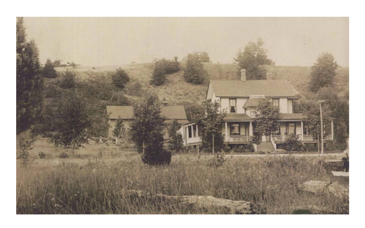
West Glenwood Building, 4594 Main Street

This complex included the two buildings (4594 and 4610 Main Street), one being on each side of what is currently The Glenwood