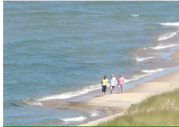
Lake Michigan provides Manistee County with 25 miles of freshwater shoreline.

Four state roads carry traffic across Manistee County and to major destinations within the county. US-31 stretches north from Holland and passes through Manistee on its route northward to Mackinaw City. M-55 is an east-west roadway that carries traffic from Tawas City on Lake Huron westward across the state to Manistee. M-22 begins just north of Manistee and follows the shoreline of Lake Michigan