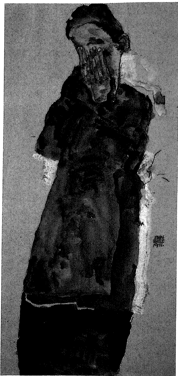
Egon Schiele, Young Woman Covering Her Face with Her Hands , 1911

ifornia at Los Angeles, who showed that the dominant males in the social hierarchy of vervet monkeys have high levels of blood serotonin, a chemical that acts as a messenger between neurons in the brain. When the dominant male is removed from the colony, however, and can no longer rule the others, his serotonin level plummets. He stops eating, huddles and appears to be deeply depressed. Intriguingly, many antidepressants, including Prozac, work by increasing serotonin in the brain. In another experiment the UCLA investigators removed the dominant