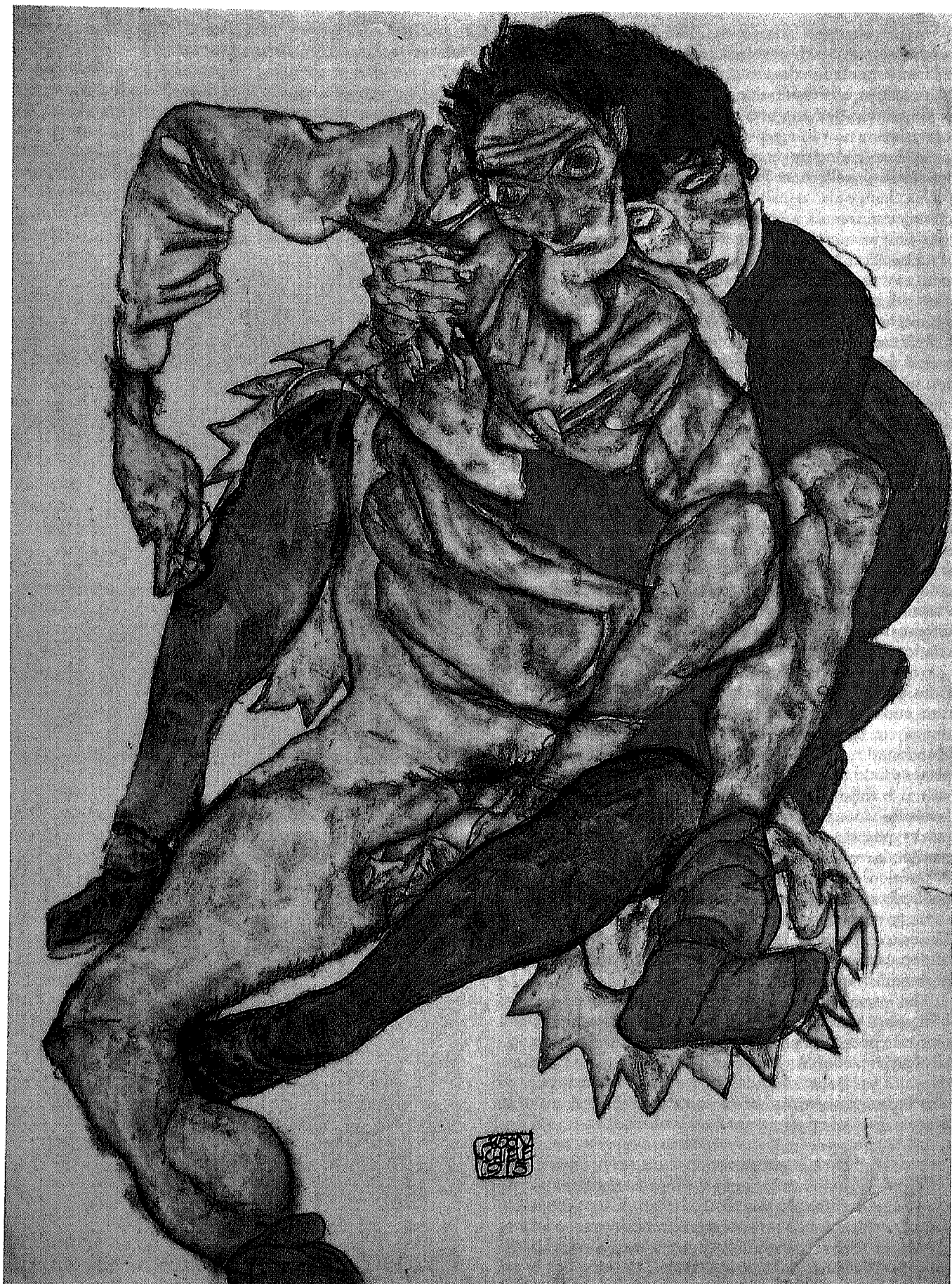
Egon Schiele, Embrace, 1915