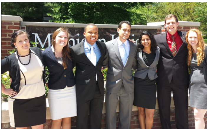
The 2013 summer interns pose together in front of the Michigan Union.