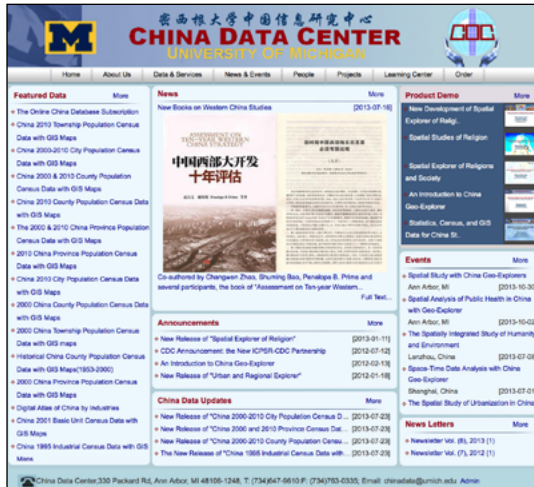
The China Data Center website home page