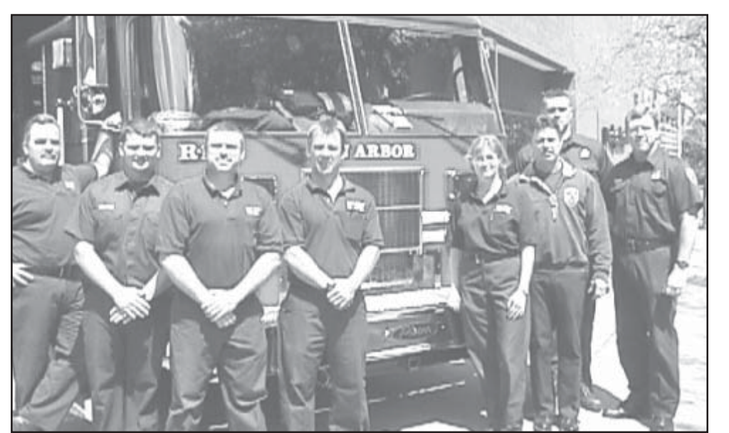
Support your local fire fighters by calling Mayor Hieftje