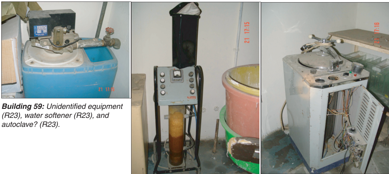
Building 59: Unidentified equipment (R23), water softener (R23), and autoclave? (R23).