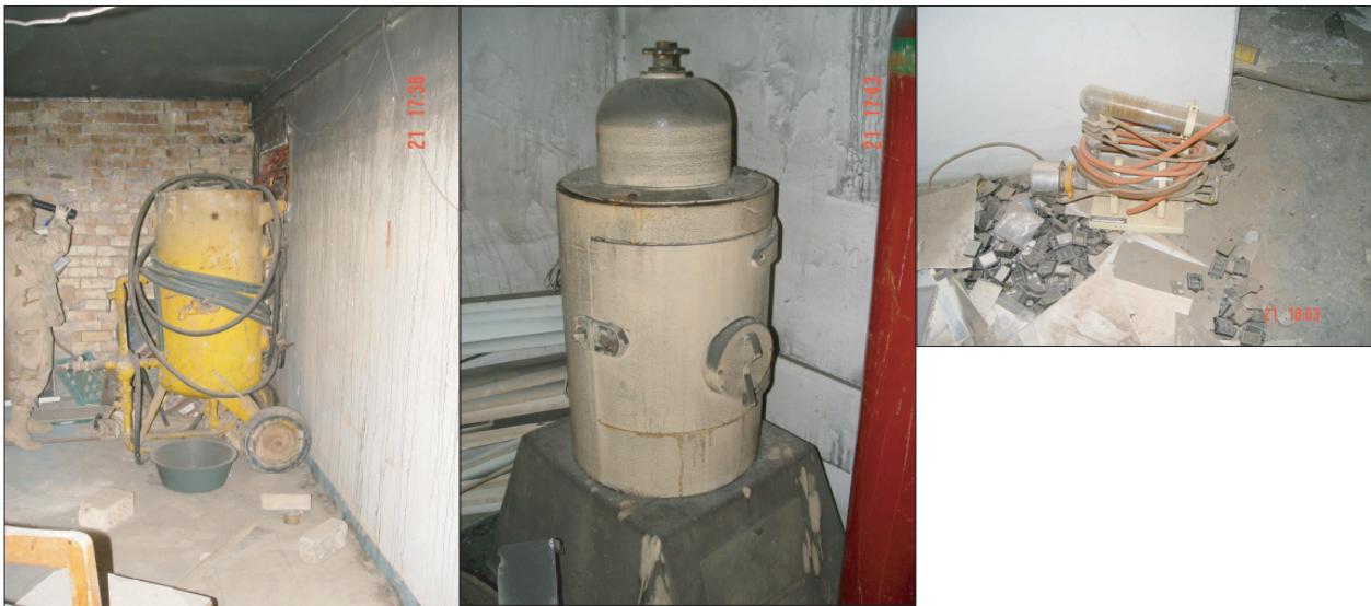
Building 59: Unidentified burnt equipment (R32), unidentified equipment (R40), and distillation equipment (R42).