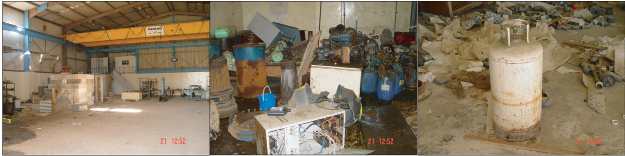
Building 17: Mechanical/woodwork workshop (R19) (left and center); unidentified gas bottle (R16) (right).