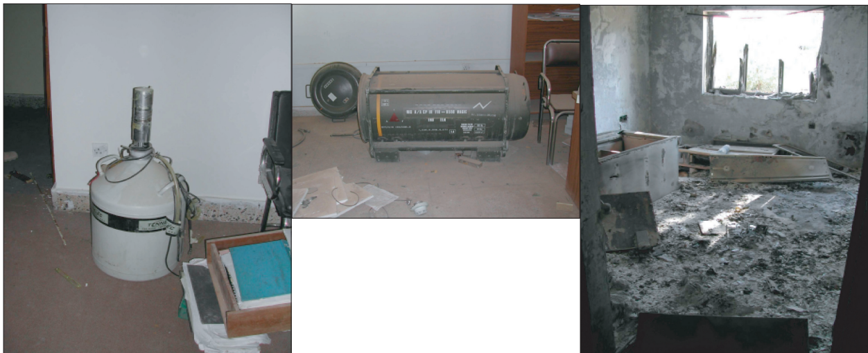
Building 3: Germanium detector cryostat (R24).