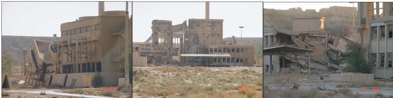
Building 17: Tammuz/cooling tower (Osirak) (left and center); Tammuz-2 (ISIS) (right).