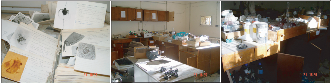
Building 59: Bacteriology laboratory (R14), chem/bio laboratory (R15), and chemicals (R15).