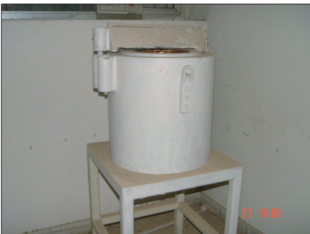
Building 59: Rad. source-led cave (R45).