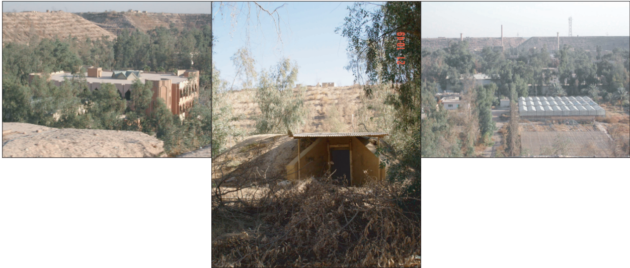
Library (from berm), bunker (behind building 167), and view from berm.