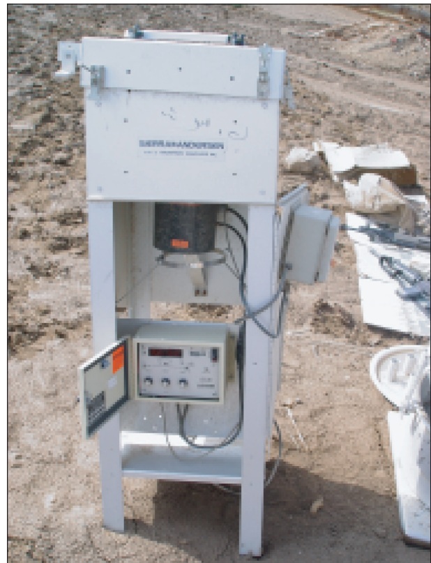
11 November 2003 Mission: Optical spectrometer (near building 90; in report), Anderson sampler (dump near main entrance).