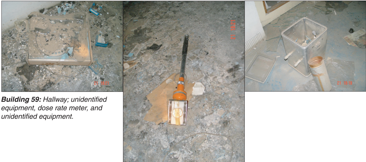
Building 59: Hallway; unidentified equipment, dose rate meter, and unidentified equipment.