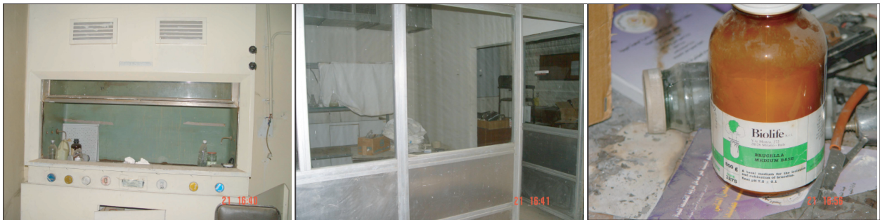
Building 59: Fume hood (R17), protected lab (R19), and brucella medium base (R20).