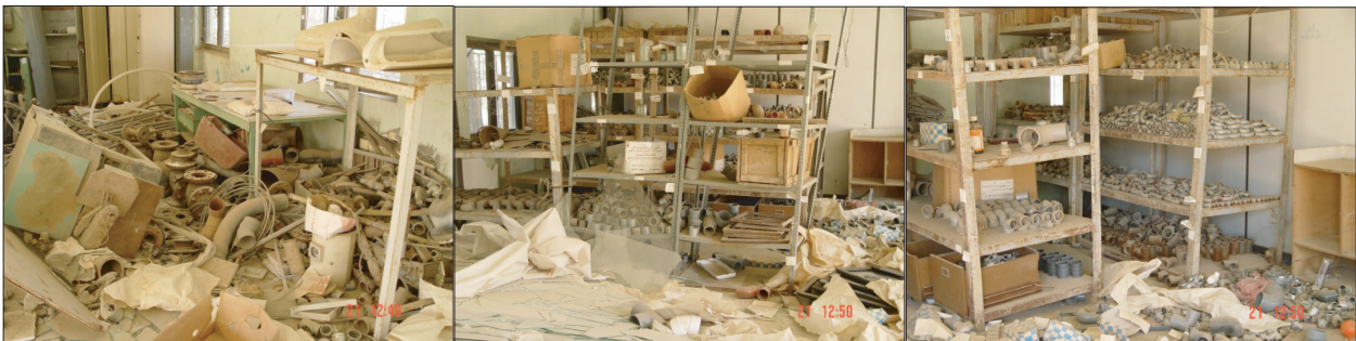
Building 17, Room 2. Mechanical/plumbing workshop.