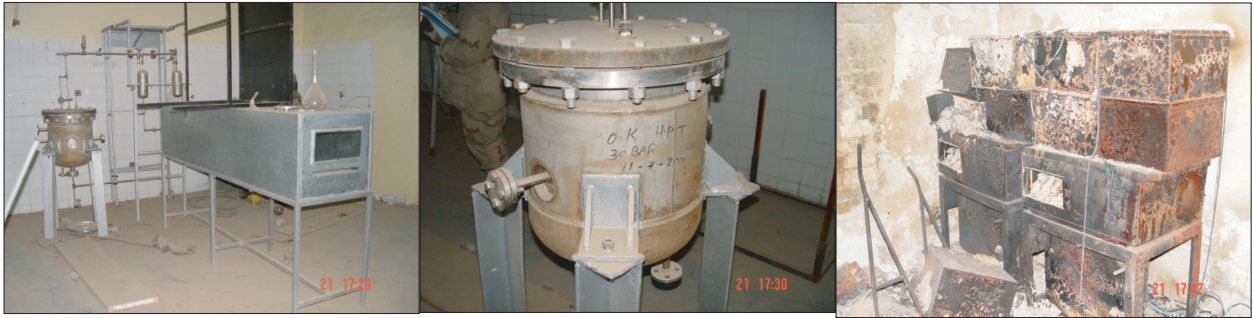
Building 59: Reverse osmosis laboratory (R29) (left and center); burnt metal cases (R31) (right).