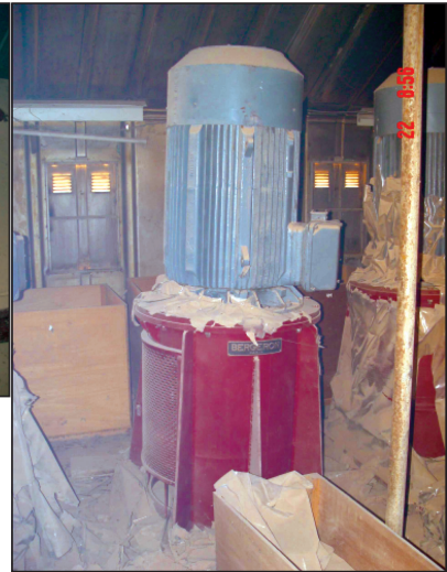
Building 37, Room 1. Crane outside room 1, pans/base, and water pumps.