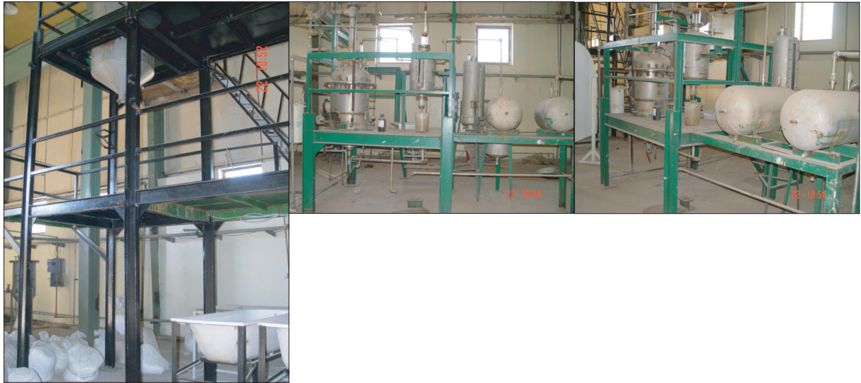
Building 53, Room 1. Bathtubs and dryer (left); clove oil production equipment (center and right).