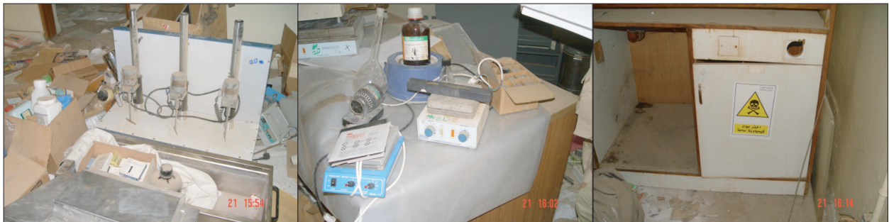
Building 59: Stirrers (R9), hotplates and formaldehyde (R9), and biohazard sticker (R11).