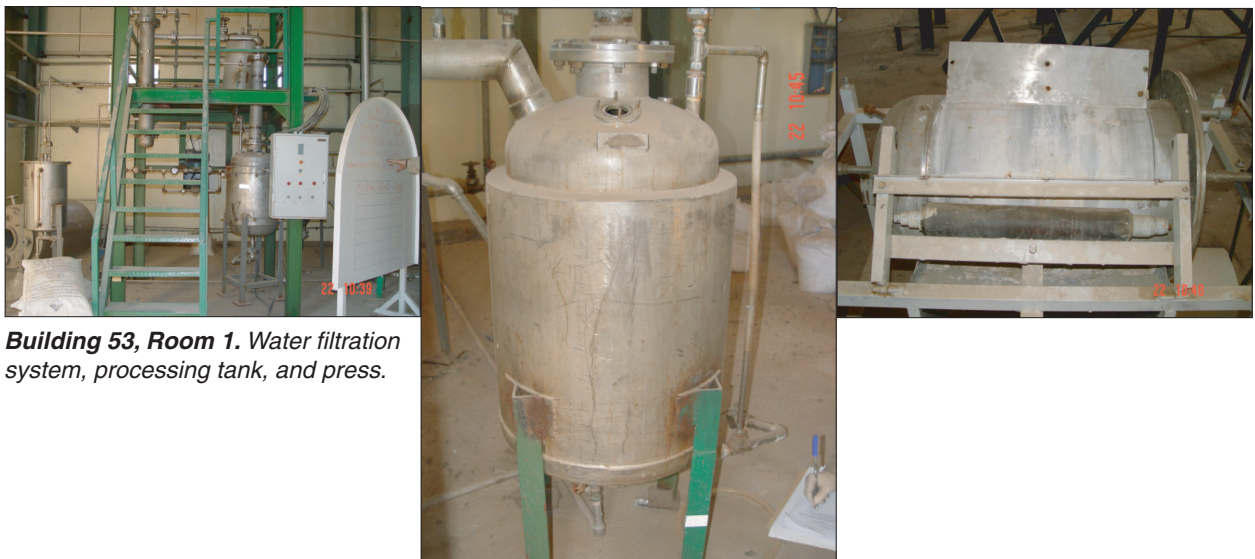
Building 53, Room 1. Water filtration system, processing tank, and press.