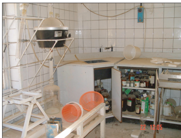
Building 53, Room 9. Chemical laboratory (left) and lab-processing equipment (right).