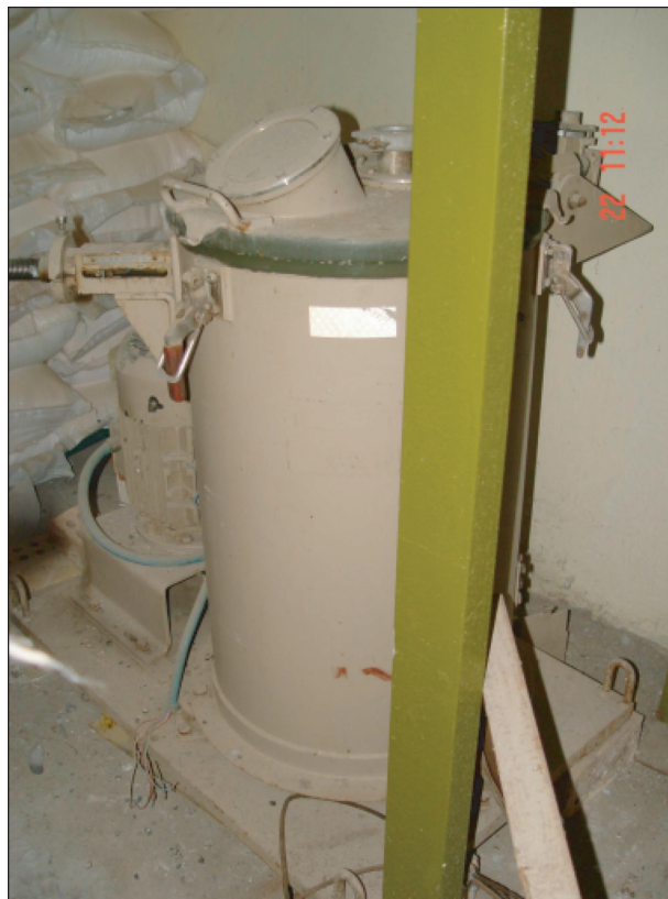
Building 53, Room 1. Dryer (left) and pressure vessel (right).