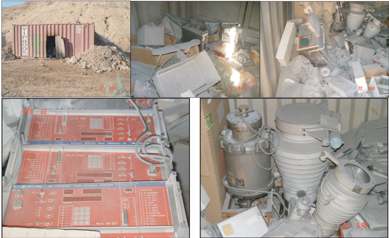
Building 163 (connex): Shipping crate (connex) (top left), digital equipment (top center and top right), high-voltage system (bottom left), and vacuum pumps (bottom right).