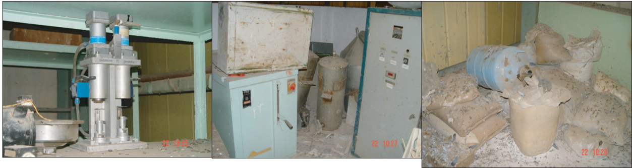
Building 16: Festo pneumatic valves, table saw (bottom left), and liquid nitrogen bottle .