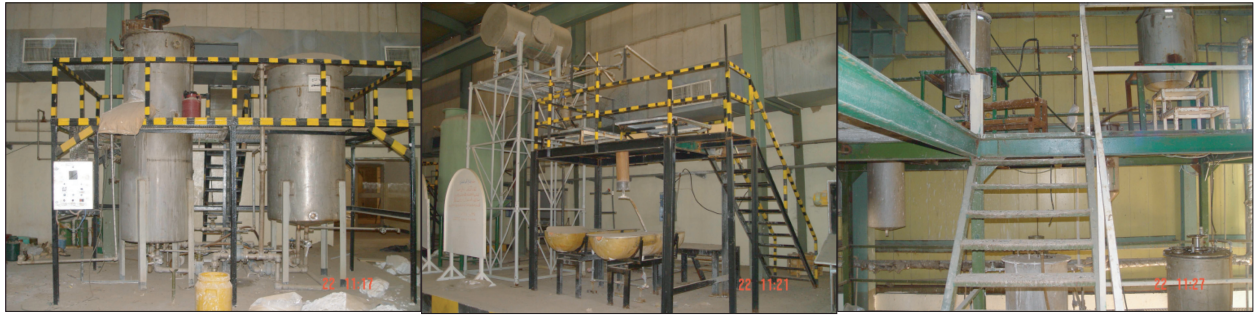
Building 53, Room 1. Production of lipton wax (left and center); zinc oxide production (right).