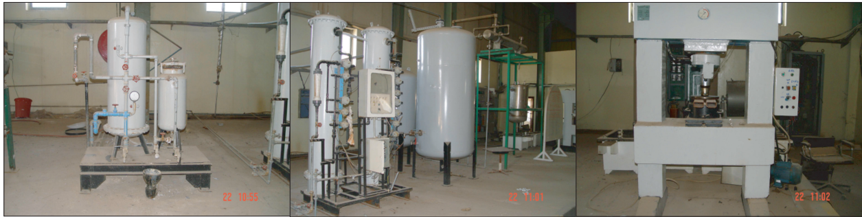
Building 53, Room 1. Water-processing system (left and center); press (right).