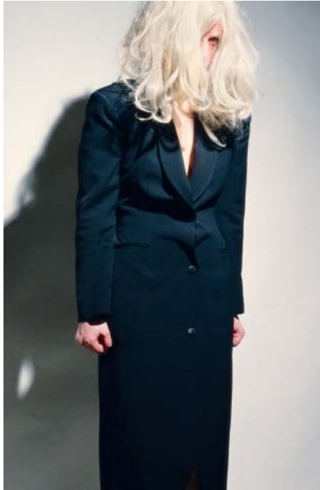
Untitled #122, 1983

Courtesy the Artist / Metro Pictures, New York