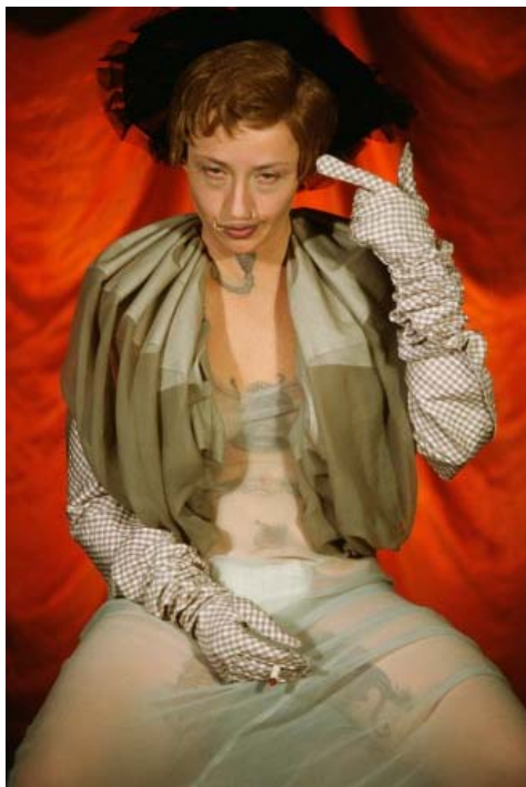
Untitled #299, 1994